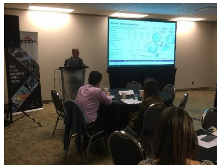
Saskatchewan Pavilion - Government and STEP Space