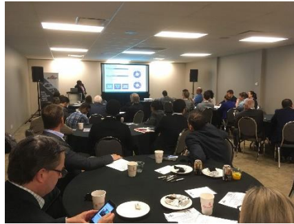
STEP International B2B Breakfast Perenco Presentation