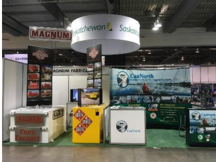
Saskatchewan Pavilion – STEP Member Space