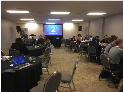
STEP International B2B Breakfast B2B Meetings