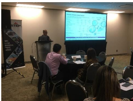
STEP International B2B Breakfast Procurement Presentation by Gran Tierra Energy