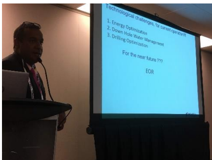
STEP International B2B Breakfast Perenco Presentation