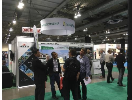
Saskatchewan Pavilion - STEP Member Space

Notice to Recipient: The attached information is provided by STEP on the express condition that the recipient of such information waives any and all claims of any nature whatsoever (including any claim based in negligence) that it may now or in the future have against STEP or its officers, directors, employees and agents resulting from or in any way connected with its use or reliance on such information.